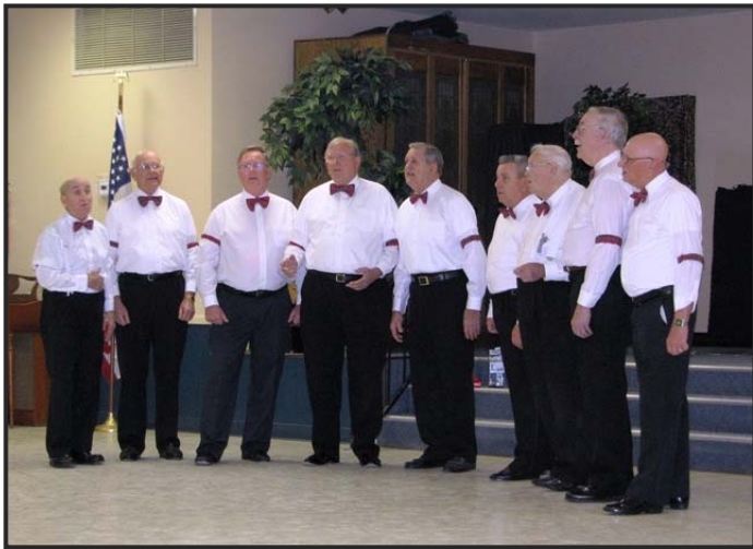
Chorus of the Highlands Barbershoppers serenade all the "Ladies in Red"